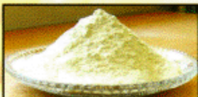
Dehydrated white/Red onion powder