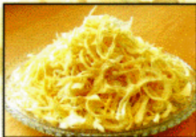
Dehydrated white/Red onion sliced