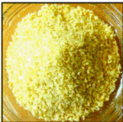
Dehydrated white/Red onion granuals