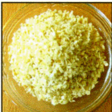
Dehydrated white/Red onion chopped minced