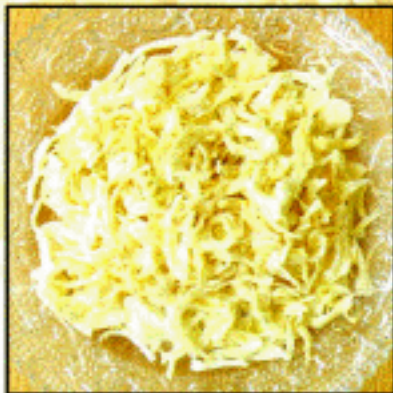
Dehydrated white/Red onion kibbled